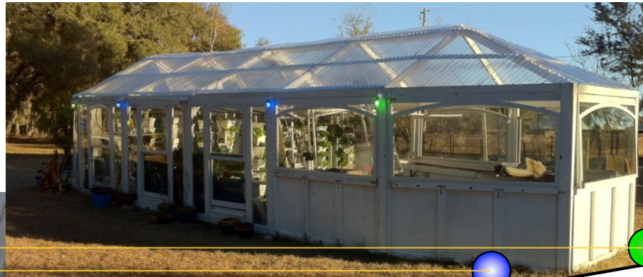
Blue Thumb Greenhouse At Cosmo's place.