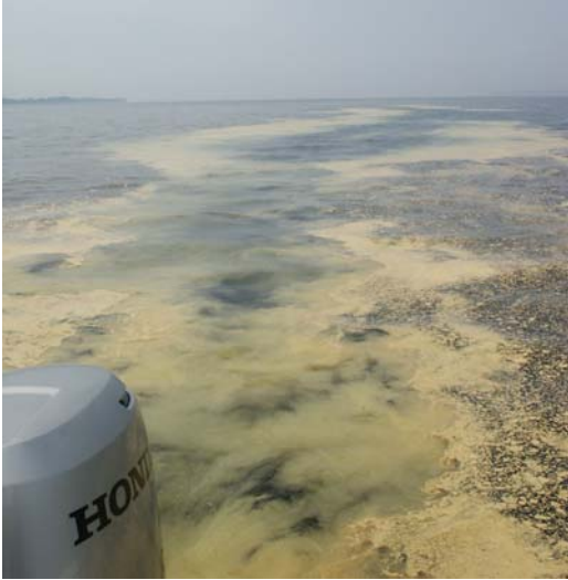
Pine pollen- Lake Champlain

2a. Material is present in long strands or hairs that tangle around paddles or boat hooks OR material is made of small particles bright mustard yellow or grass green in color.