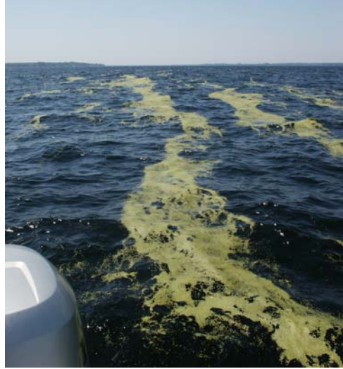
Duckweed - Lake Champlain