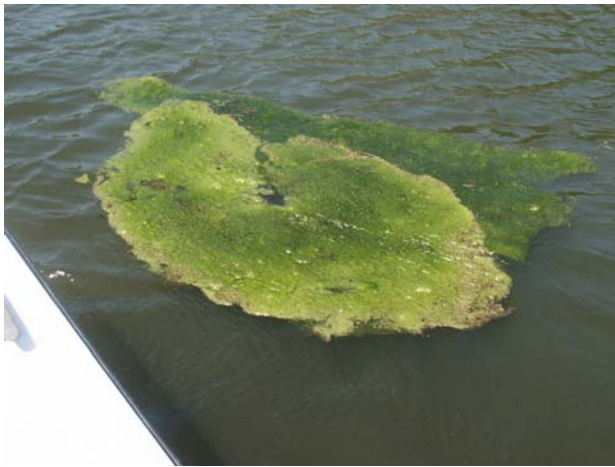
Floating green algae