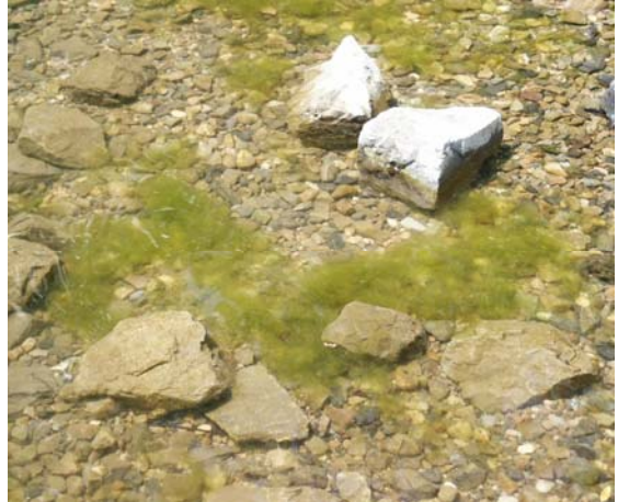
Attached green algae